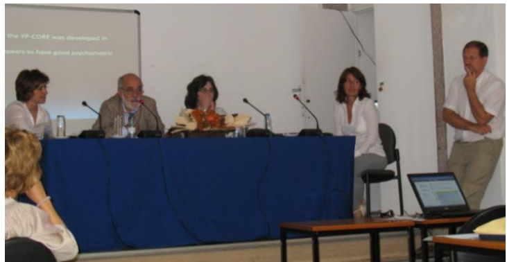
Some presentation Sessions