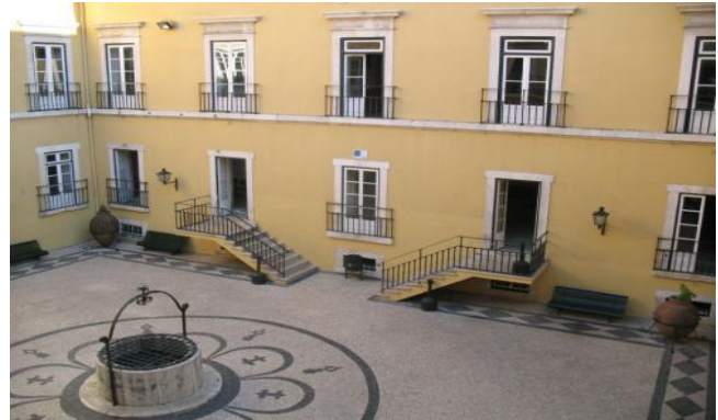
Universidade Autónoma de Lisboa

All the activities were designed to encourage participants and the teaching staff to actively engage with one another and, as well, to bring therapists and researchers together. It was our aim to gather researchers and clinicians from different psychotherapeutic schools to share explore and reflect on psychotherapy research.