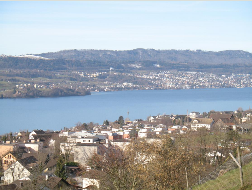
Boldern, Zurich - February 2010